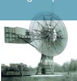
1888: Charles Brush develops first large wind generator producing 12 kW DC