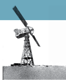
1941: Putnam's 1.25 MW turbine demonstrates need for lighter materials