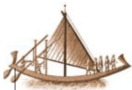
6000 BC: wind powers the first sailboats along Egypt's Nile River

In Canada, there is more than enough wind potential to make a big contribution to our energy needs. Wind energy is an affordable and viable source of electricity, powering 285,000 Canadian homes in 2006. Using our untapped wind resources might one day see us provide for 20% of our electricity needs – enough to power 17 million homes.