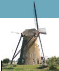
1600s: windmills pump water from Holland's reclaimed wetlands