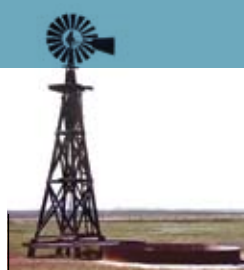
Early 1900s: Windmills drive pumps & generators across rural North America