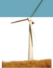
2006: 3 MW turbines in production and 5 MW prototypes are tested